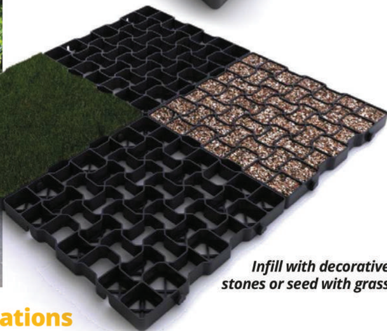
Infill with decorative stones or seed with grass