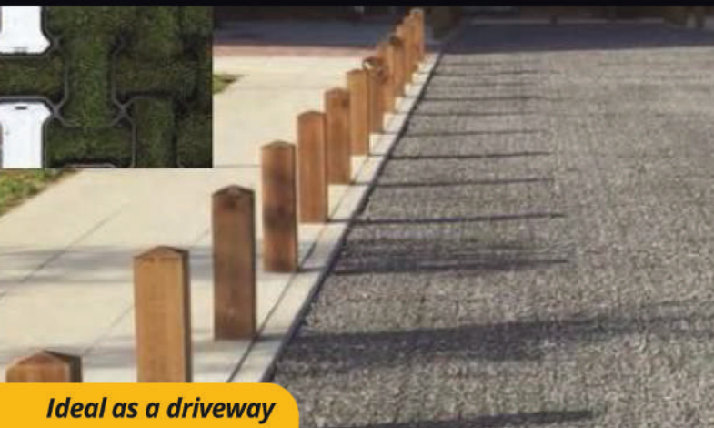
Ideal as a driveway