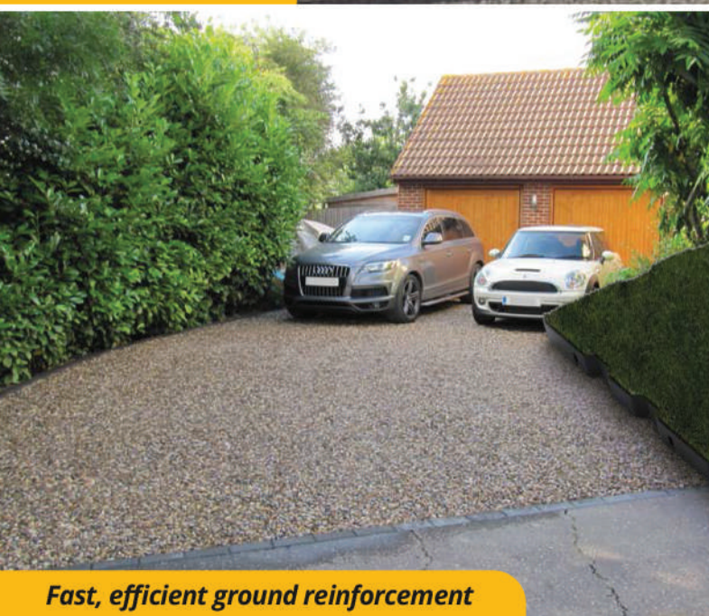
Fast, efficient ground reinforcement

Strong cellular grid withstands loads up to 500 tonnes