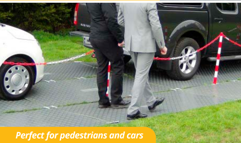
Perfect for pedestrians and cars