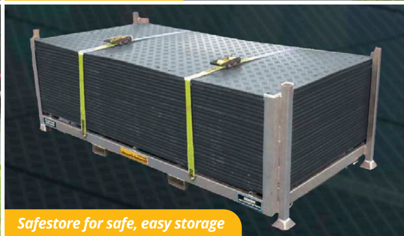
Safestore for safe, easy storage