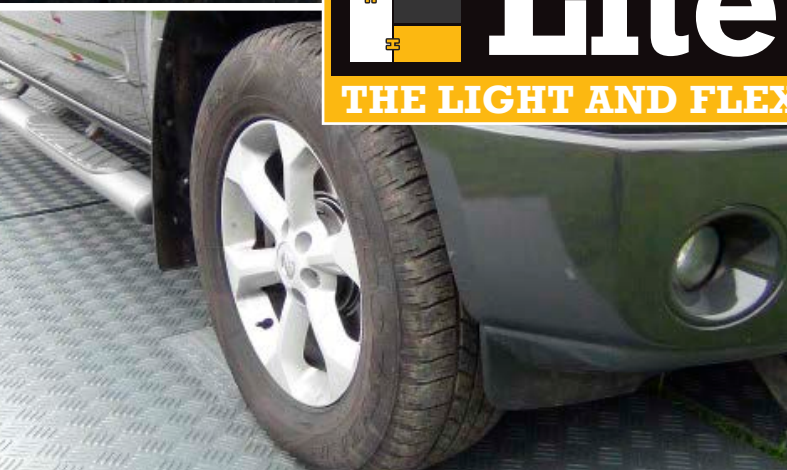
Checker plate tread for extra grip