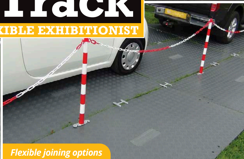
Flexible joining options